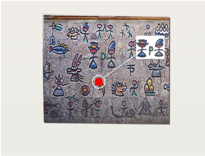
Fig. 2 Virtual zoom